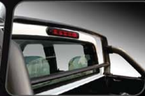
LED HIGH-MOUNTED 3RD BRAKE LIGHT, ROLL BAR