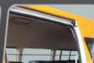
Wide Opening Sliding Door