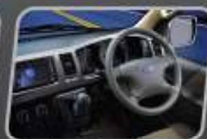
Simplified Central Control