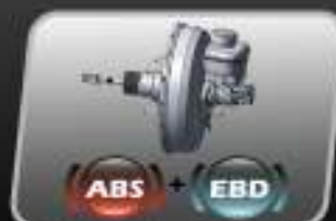
Advance Brake System with Intelligent Brake Assistance