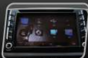
Touch Screen DVD + Reverse Camera