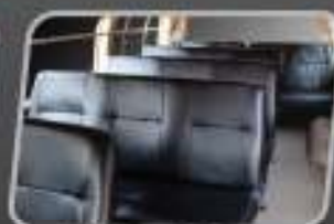
PVC Bench Seat