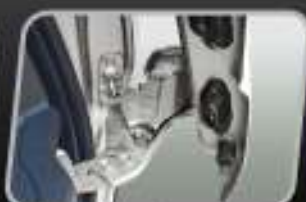
Anti-sliding Door Lock