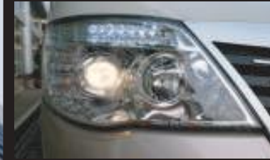
Projection Head-lamp & LED Light