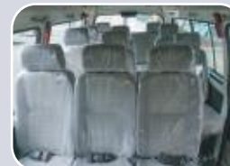
Spacious Passenger Seat