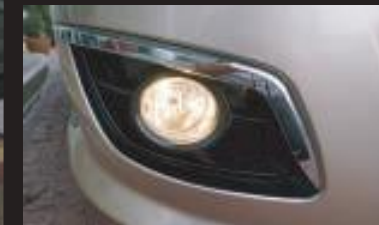
Modern Design Foglamp

2.8L Common Rail Turbo Diesel Engine (EURO III)