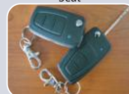
Switchblade Key with Remote Control