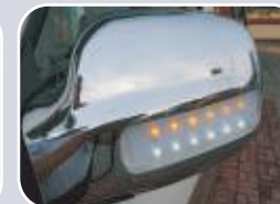
Side Mirror with Signal Lamp & Daylight