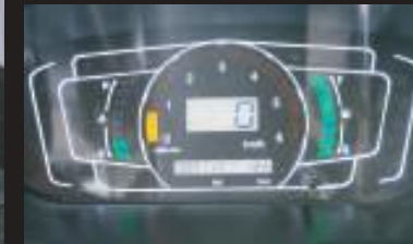
Digital Panel Meter