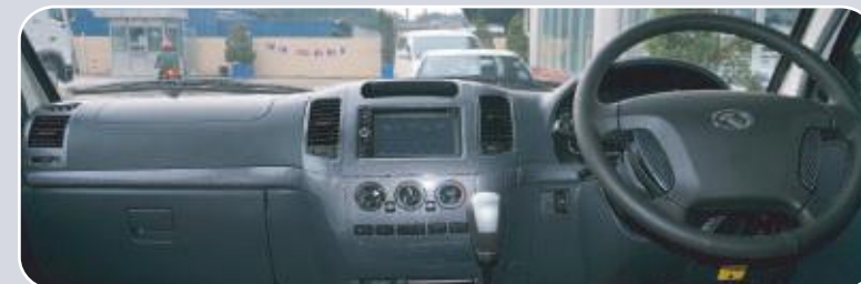
Modern Dashboard with 4-Spoke Tilt Adjustable Power Steering Wheel