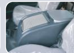
Middle Console Box