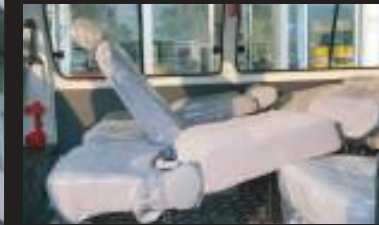
Fully Reclinable Seat Bed with Side Shift*