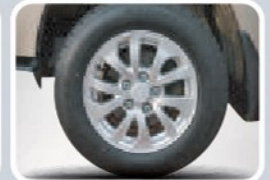
Sport Rim (Optional Accessories)