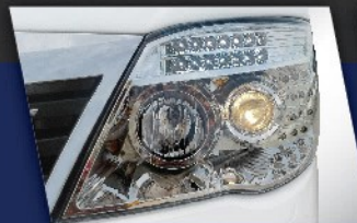
Projection Head lamp & LED Light