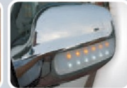
Side Mirror with Signal Lamp & Daylight