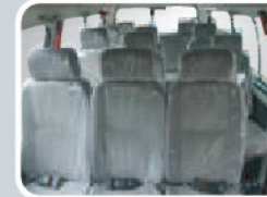
Spacious Passenger Seat