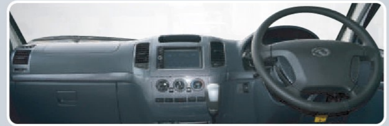
Modern Dashboard with 4-Spoke Tilt Adjustable Power Steering Wheel