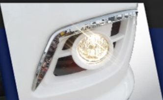
Modern Design Foglamp