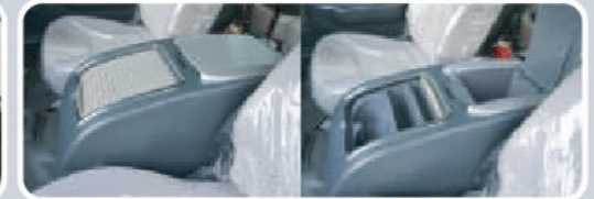
Middle Console Box