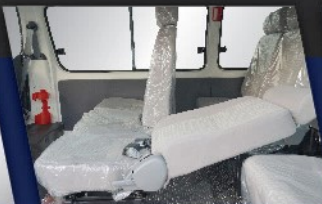
Fully Reclinable Seat Bed with Side Shift*