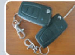
Switchblade Key with Remote Control