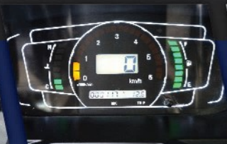
Digital Panel Meter