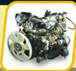
JX104 with Turbo Engine