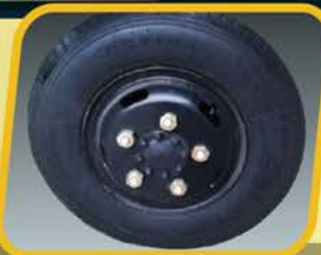
JX104 with Double Bearing