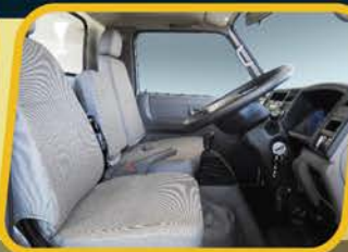
Spacious & Bright Cabin Design